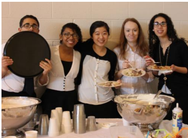
Left: Attendees stop by the tables to see if they'd like to bid on the dozens of items that were donated. Above: Student Council helps with serving (and eating).

"My favorite part about the auction was the many laughs I had! We had so many spills due