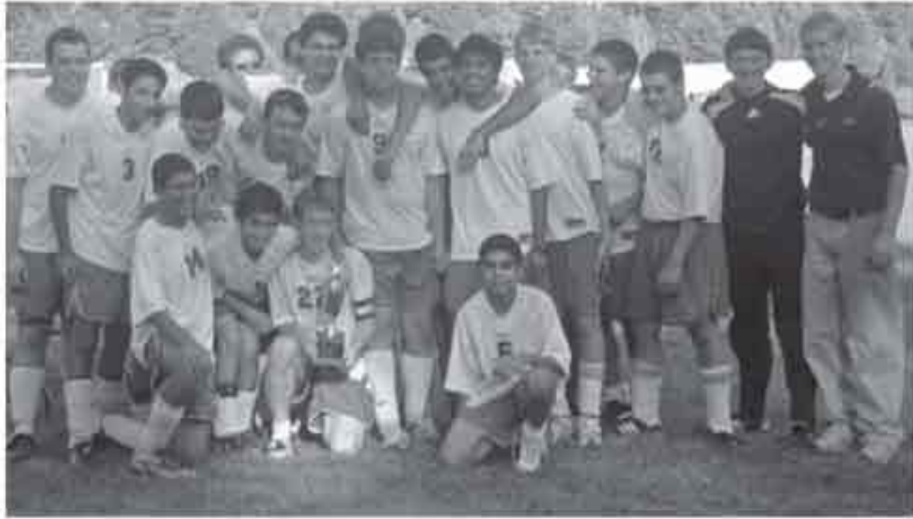
First time Champs